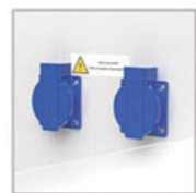
Waterproof Socket 2 waterproof sockets are located in the side wall, for optimum convenience of using small devices inside the cabinet.