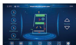
LCD Display 7 Inch touch screen display is easy to monitor all the safety parameters at a glance and ergonomically sized control panel improves user interface.